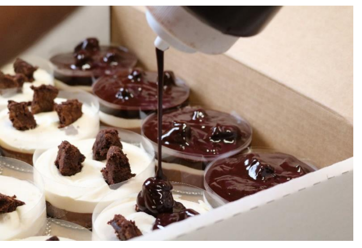
lecithin, pure vanilla)